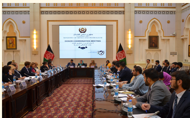
Over 20 International Organizations and embassies participated in the Donor Coordination Meeting on October 9, 2017.